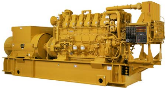
Image shown may not reflect actual package