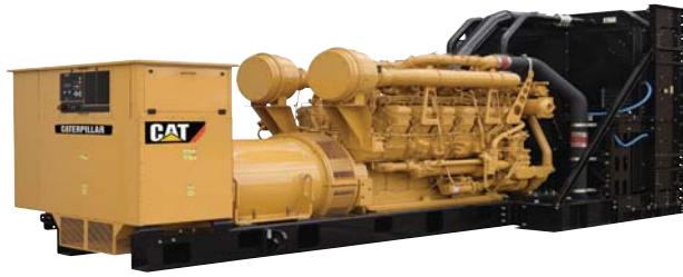
Image shown may not reflect actual package.